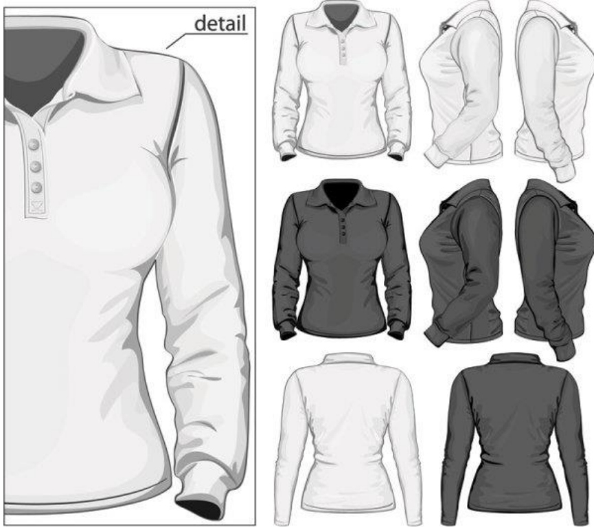
Women's polo-shirt design template. Front, back & side views. Long sleeve. No mesh.